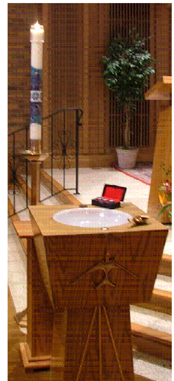
Paschal Candle and the Baptismal Font