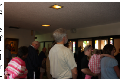
Each of us should have a seat.

to our sanctuary while not being directly in the sanctuary. It will be a good sign of welcome to those entering the church and of respect and concern for the ministries of our parish.